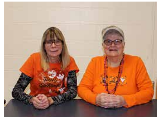
Early Childhood School Cafeteria Staff