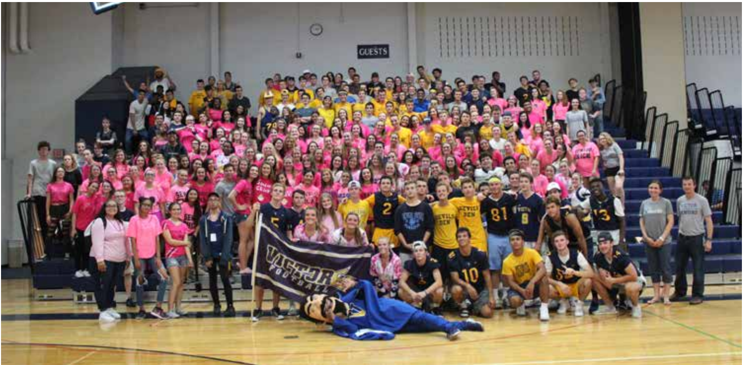
senior class 2019, taken at pep rally, September 2018