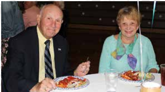
Scenes from our 2019 Ball

Free and open to ALL Victor Central School District Senior Citizens! (55 and Older)