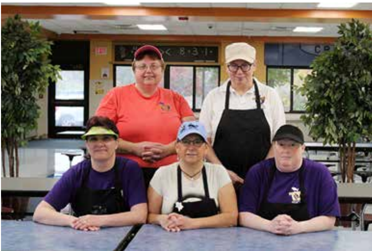
Primary School Cafeteria Staff