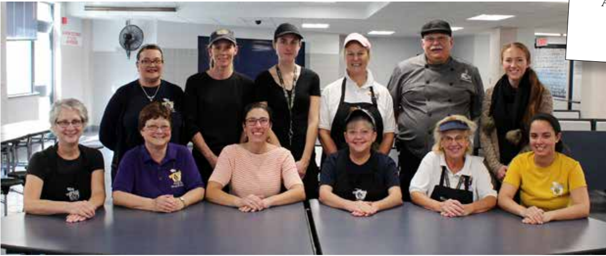
Senior High School Cafeteria Staff

Sample Menu: Baked Breaded Chicken w/ Apple Cinnamon Muffin Roasted Redskin Potatoes Ham w/Swiss on WG Kaiser Assorted Fresh Fruit Diced Peaches Diced Pears