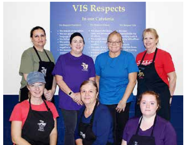
Intermediate School Cafeteria Staff