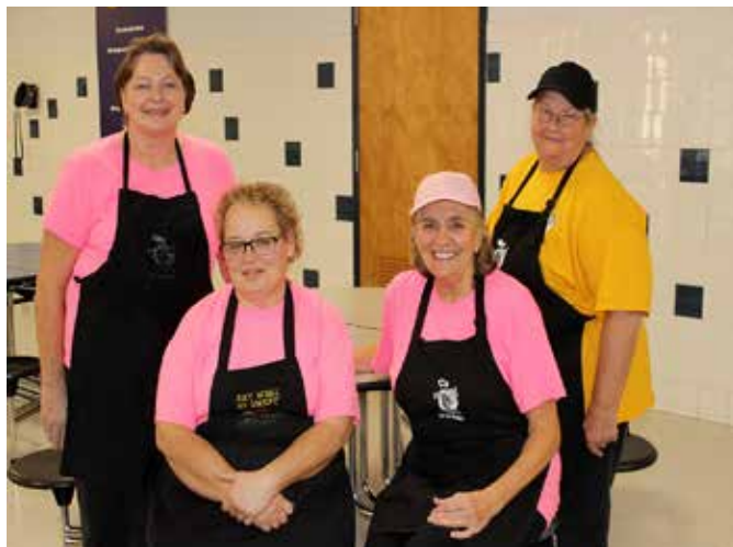
Junior High School Cafeteria Staff