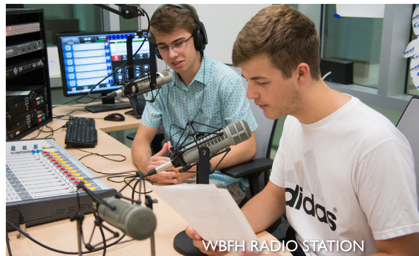
WBH RADIO STATION