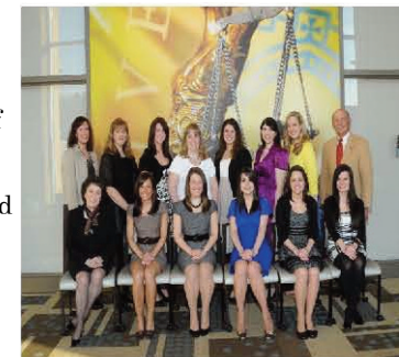
Class of 2009-2011