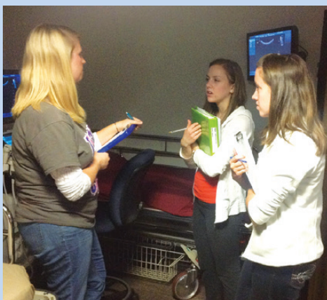
OT and Sonography students – IPE Activity

This is the second year the two departments engaged in this activity.