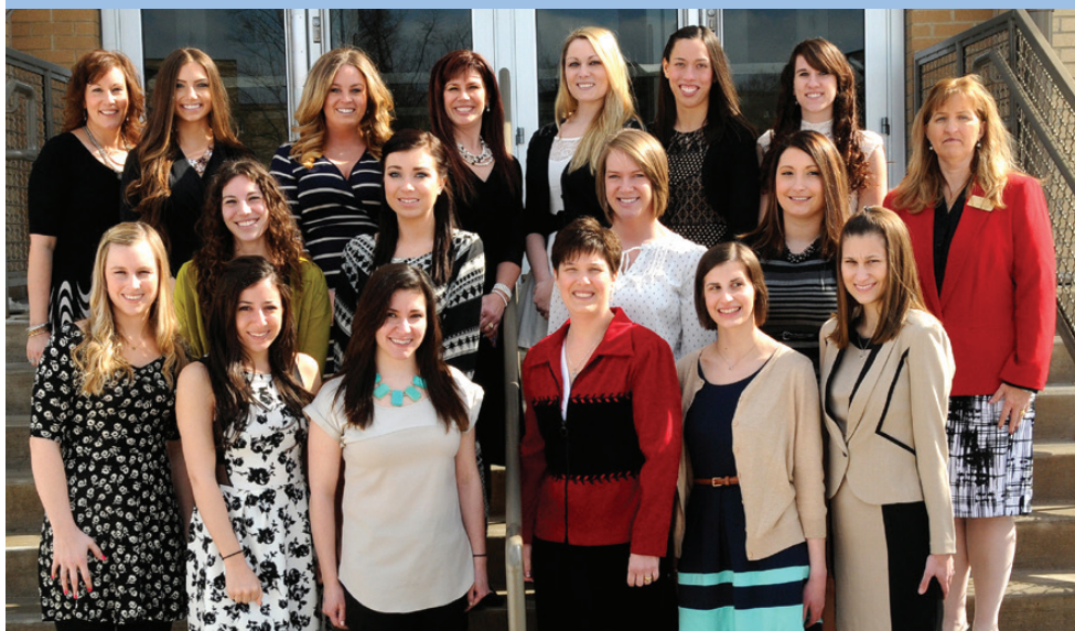
Congratulations to our 16 Sonography graduates. We have a 100% pass rate on the certification exam (to date) for the current class.