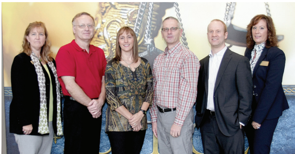
Education Symposium Presenters

The Sonography Department successfully hosted a continuing education event that provided five (5) CMEs with 60 attendees. Specialties included Pediatric GI, Liver Transplant, Transducer Infection Control, and whole Breast Sonography