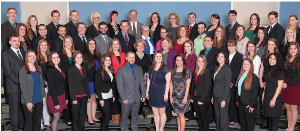
Doctor of Physical Therapy 2014 Class Group Photo