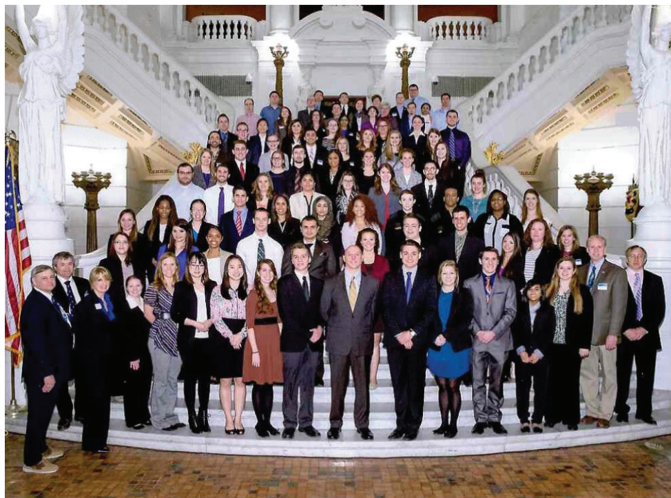
SLP Students Participate in Research on the Hill in Harrisburg, Pa.