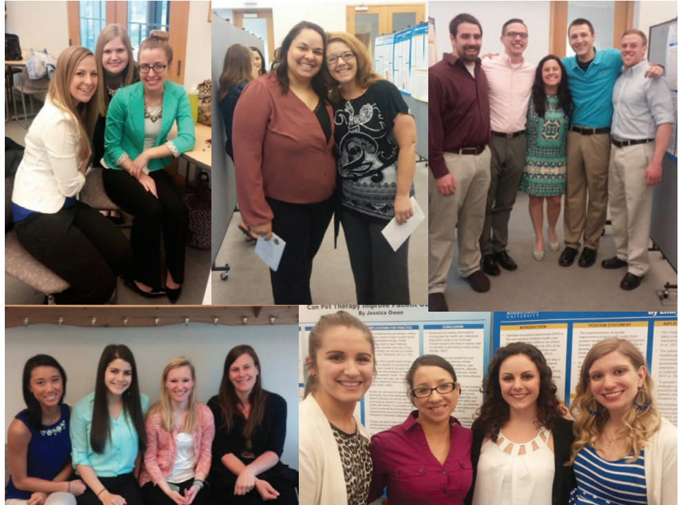
Thirty-eight senior undergraduate students present their capstone projects during Nursing Student Research Poster Day.