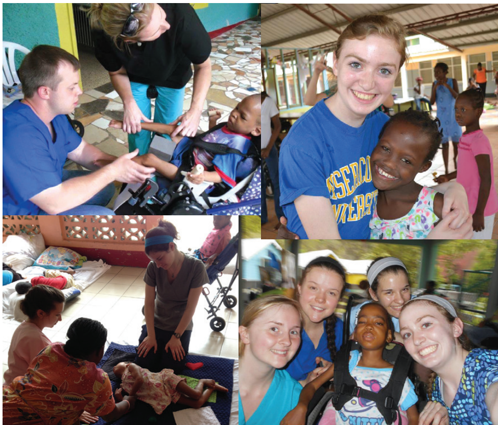
OT Students on Service Trip to Jamaica

Currently the Speech-Language-Hearing Center, Summer Autism Sensory Camp (through OT) and the Student Club—Autism Speaks will be providing community resources as the major components of the center. Activities currently in development include a health care provider autism certificate and adult autism work integration clinic.