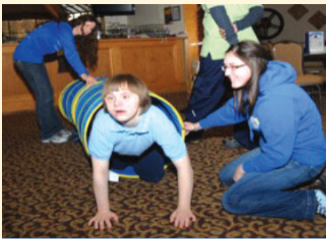
OT Students Assist with Winter Special Olympics in Hazleton