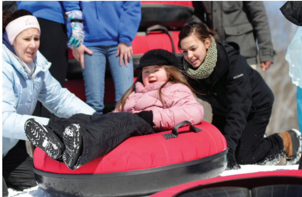
OT students helped organize a Special Winter Olympics in the Hazleton Area School District. See page 5.