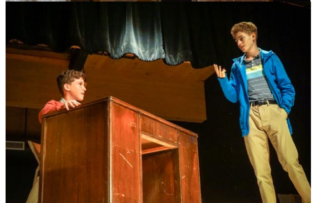
Fall play rehearsal