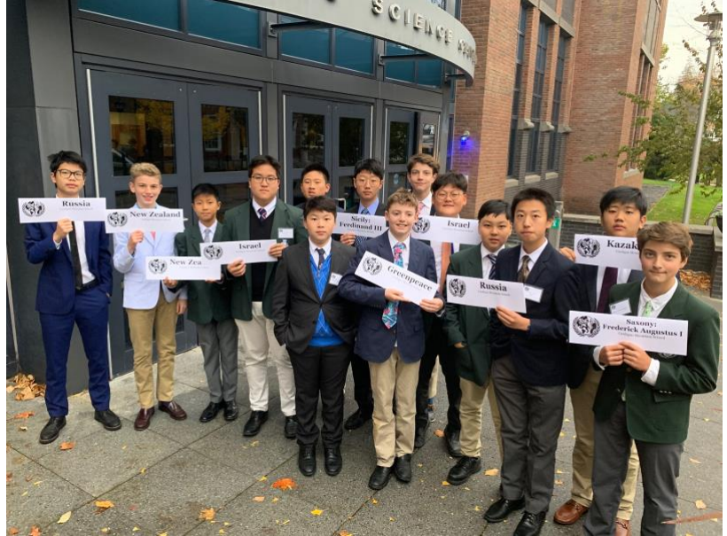
Model U.N. Participants

One thing we like to do in Model U.N. is to allow everyone to speak and debate. We usually talk about current topics or play a game. On our last day, we did a game where each student had to use 25 words or less to get someone else to say a word. It gives students the chance to express concise messages and communicate with others.