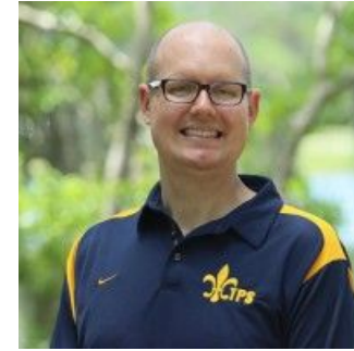
Director of Advancement