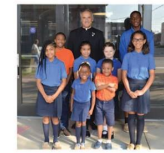
44 MOMENTUM • SUMMER 2016