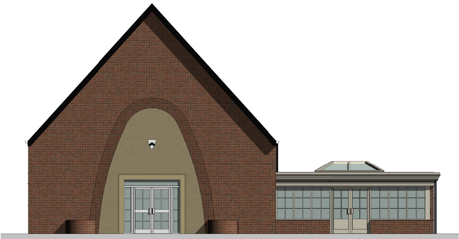
Proposed_North_Elevation 1 : 100