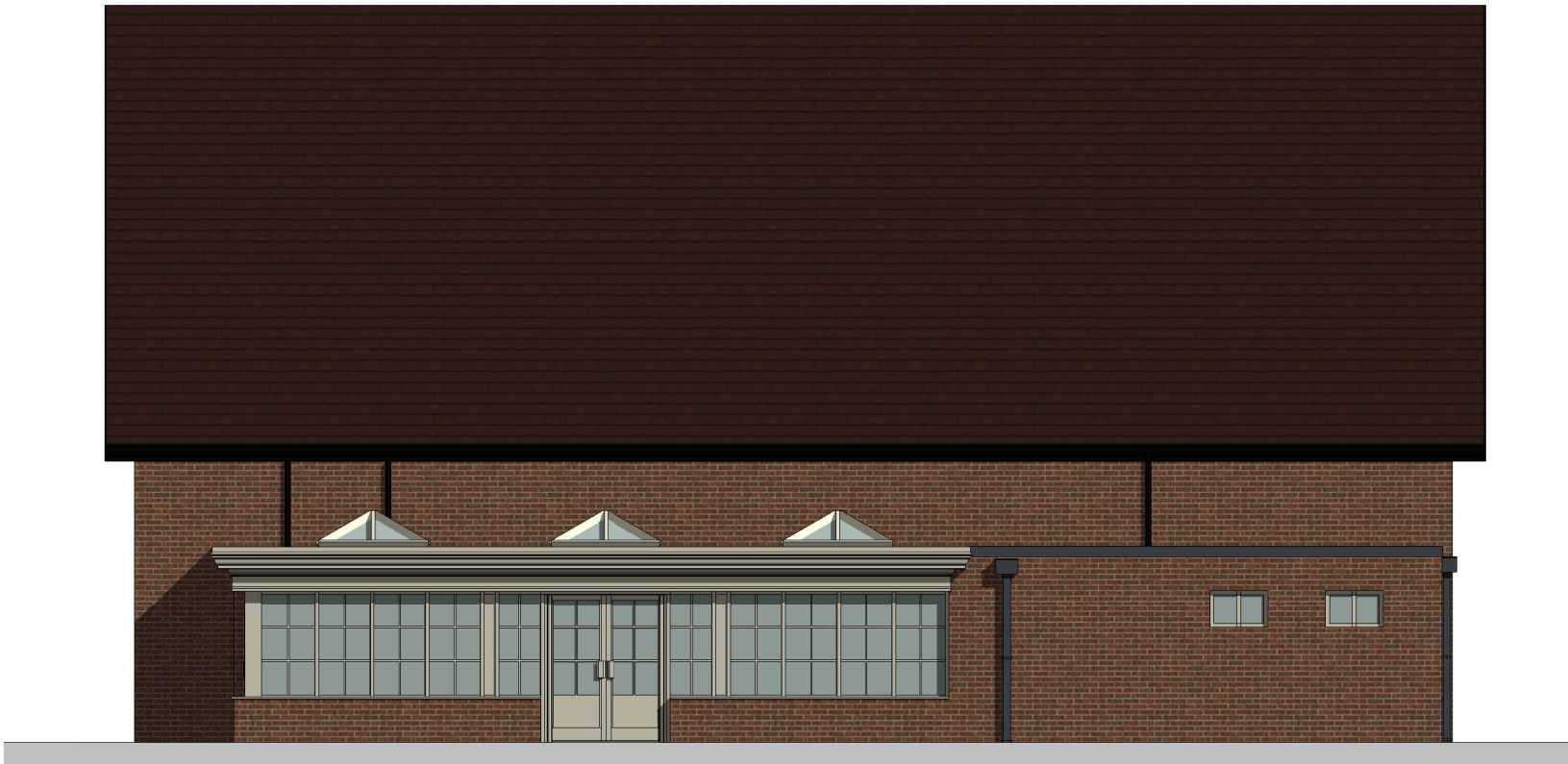
Proposed_West_Elevation 1 : 100