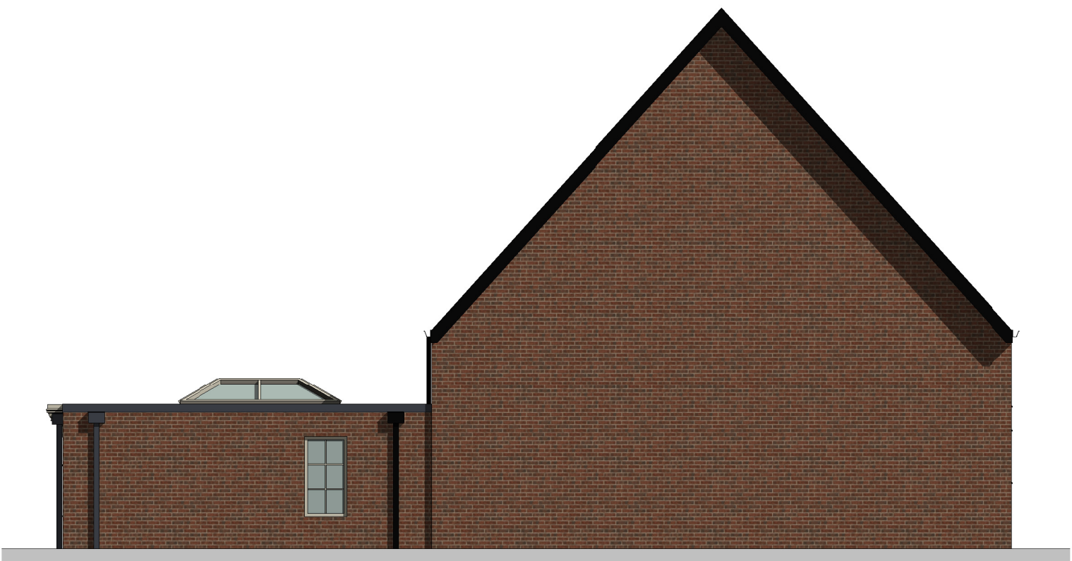
Proposed_South_Elevation 1 : 100