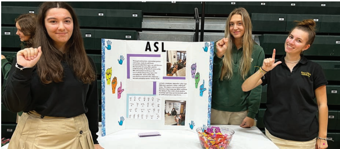
Clockwise: ASL Club practices signing, Chess Club is always ready to compete, and our newly formed Asian Cultural Club boasts 50 members and has been known to indulge in home-made dumplings.