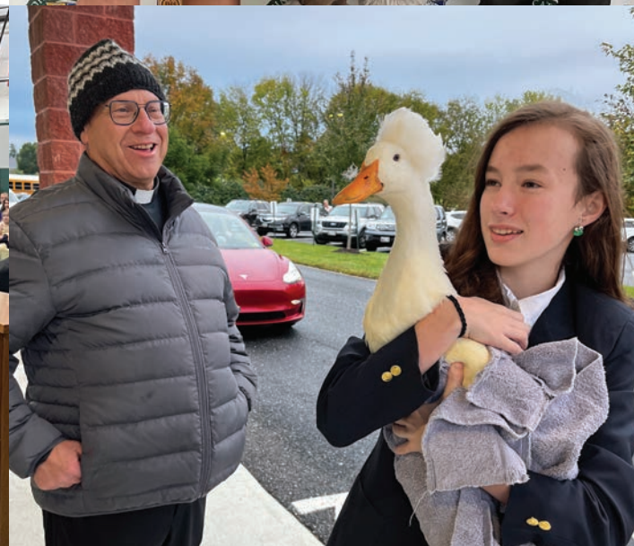
Clockwise: Seniors compete for the honor of Mr. Viking. On the feast of Saint Francis, our Chaplain blesses our family pets. Students take a field trip to the Mexican Geniuses Art Exhibit. A little friendly powder puff game during spirit week. Students showcase their talents during Mass.