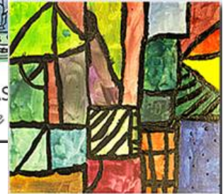
KLEE ABSTRACT PAINTING Fifth Grade