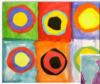
KANDINSKY'S CIRCLES Kindergarten