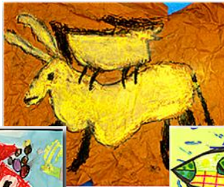
CAVE ART Second Grade