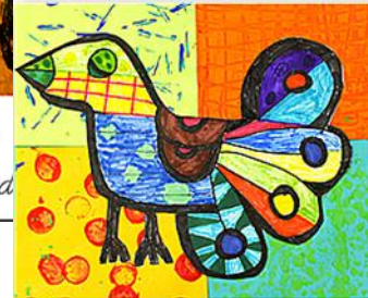
BRITTO MIXED-MEDIA Third Grade