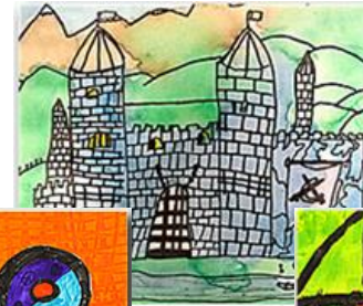
ARCOLOR CASTLE Fourth Grade