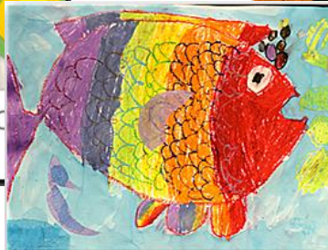
MISTER FISH First Grade