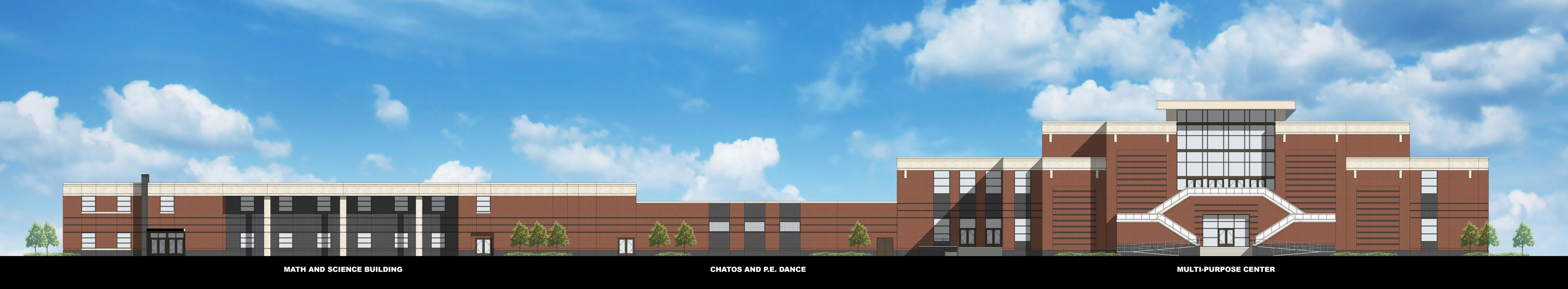
MATH AND SCIENCE BUILDING