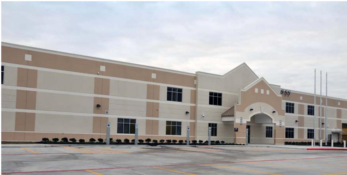
Support Services Center