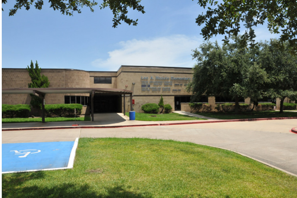
Rizzuto Elementary School (Before and After Renovations)