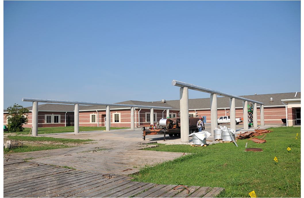
Heritage Elementary School Covered Playground Area