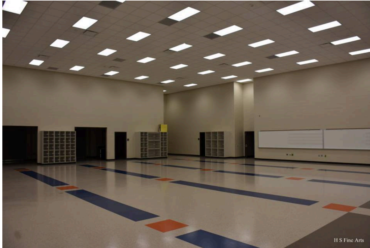
Fine Arts Facility