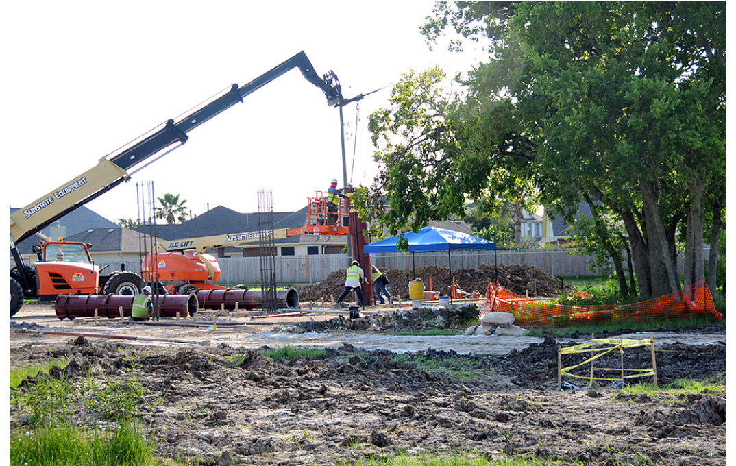
Leo A. Rizzuto Elementary School Covered Playground Area