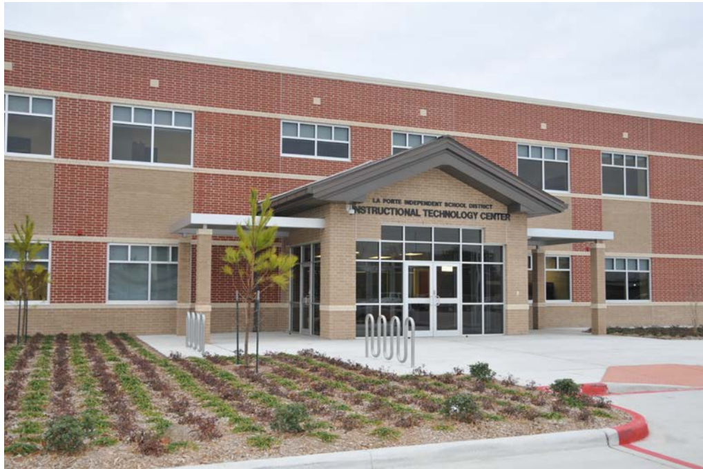
Instructional Technology Center