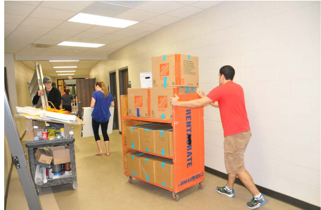
Fine Arts Facility