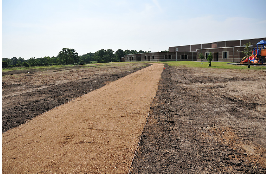
Bayshore Elementary Covered Playground Area and Walking Track