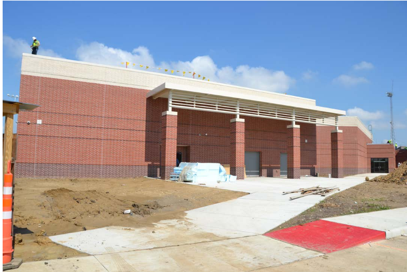
Fine Arts Facility