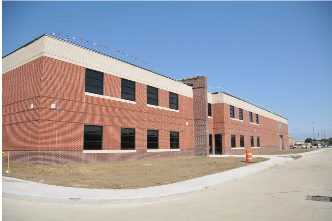
Career and Technical Education Center