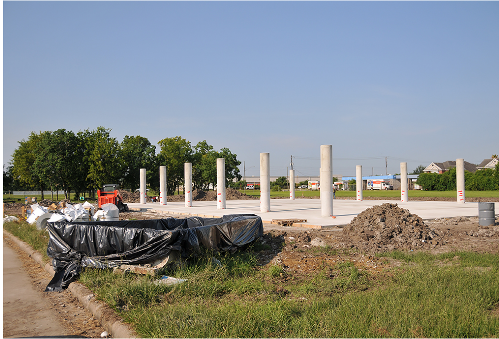
Jennie Reid Elementary Covered Playground Area and Science Classrooms