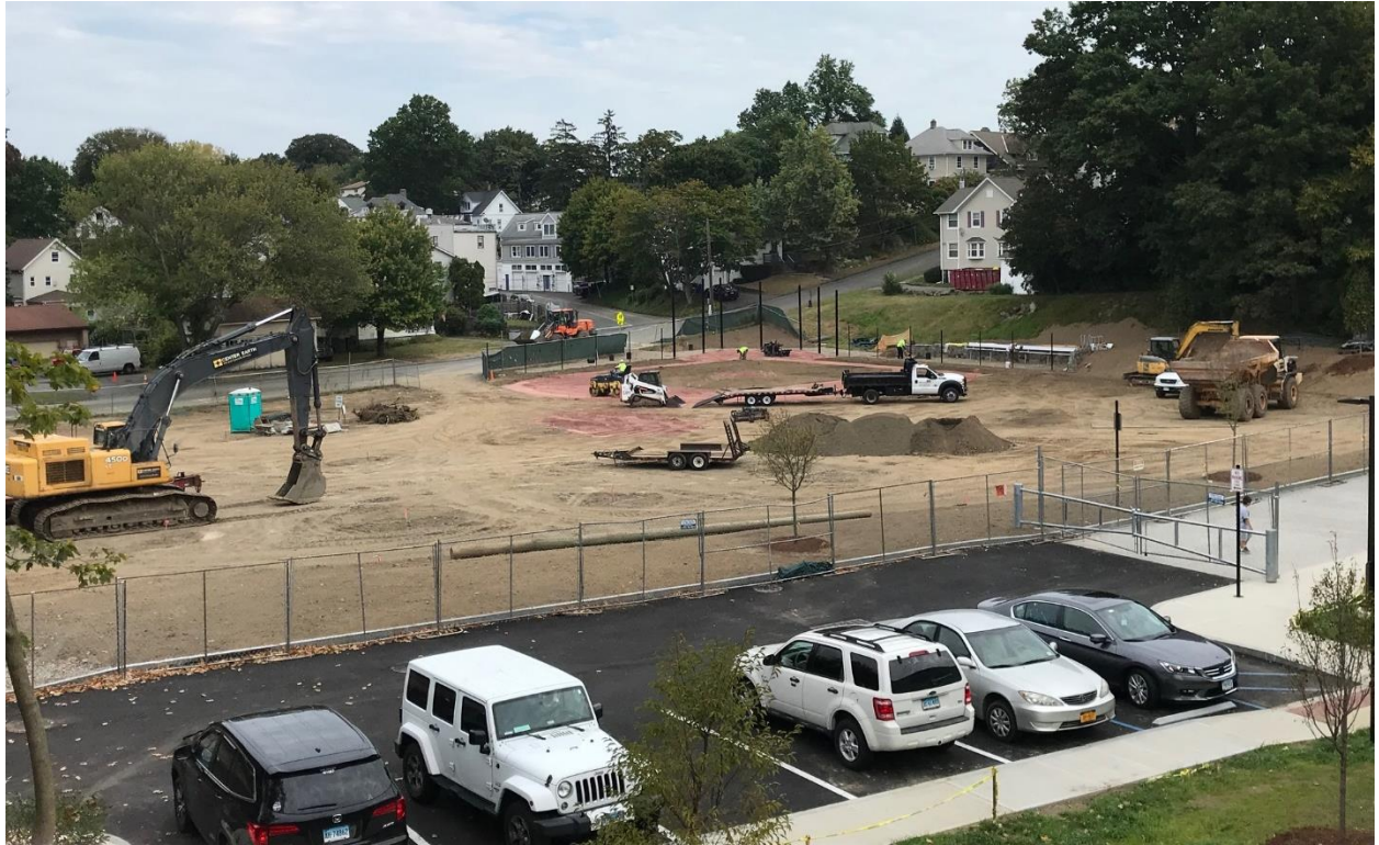
Visit our website: <a href="http://www.greenwichschools.org/NLSBC">www.greenwichschools.org/NLSBC</a>