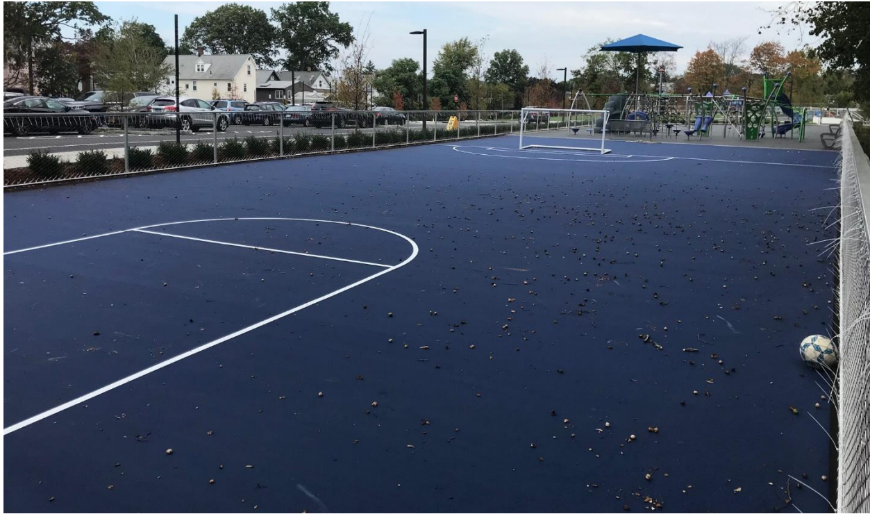
Privacy Fence installed along property line – 10/2/19

Basketball / Soccer area looking North -\,10/2/19