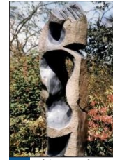
9 Fabian Madmombe Rock Form