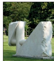
23 Jan Newbery Open Monolith