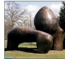
14 Millfield Students Homage to Henry Moore