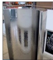
19 William Pye Cornucopia