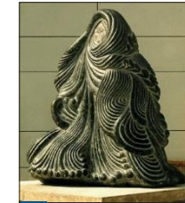
16 Dominic Welch On The Wind