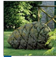
8 Peter Randall-Page Sequoia or Millfield Cone