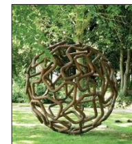
24 Julian Wild System No.11