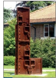
6 Charles Hadcock Shift