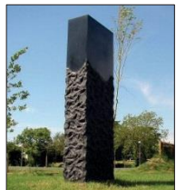
22 Simon Hitchens A Moment of Stillness