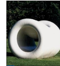
17 Jane Gledhill Hollow