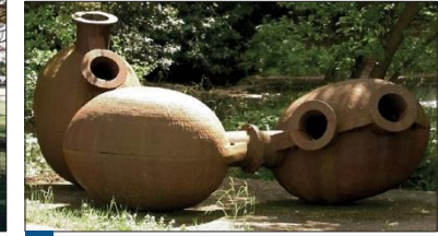
12 Neville Gabie Deep Dark River IX