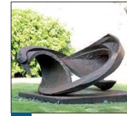
10 Tom Grimsey Poseidon's Dish