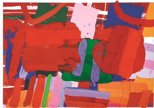
Greenwich I, 1991, Screenprint, Collection of Advanced Graphics London

Private View: Monday 2 September, 7-9pm.