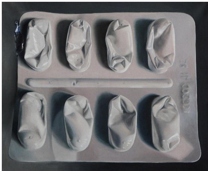
Anastasia Wildig – Aberystwyth, 'Pill Painting 001 – Paracetamol' 2016-17

With the arts under increasing pressure across all sectors of education it is even more important for us to support those students who are emerging from art schools and provide opportunities to exhibit. The MA show continues to represent the Atkinson Gallery's ethos of supporting aspiring artists and bringing high calibre art to the South West.