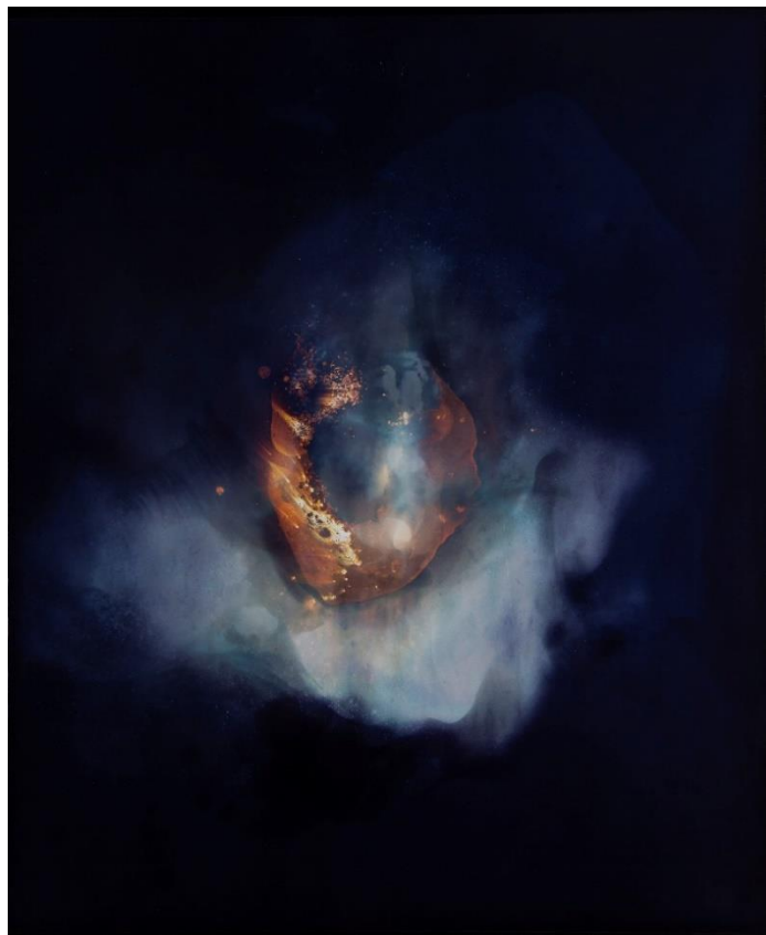
'Site of Failure III' Madeline Jones – UCA Canterbury (2018)

If you have not entered The Summer Show previously and would like to receive information about entering, please contact the gallery to state your interest and the best means of contacting you. Previous entrants will be contacted automatically. If you wish to be removed from this mailing list or our main mailing list then please inform the gallery.