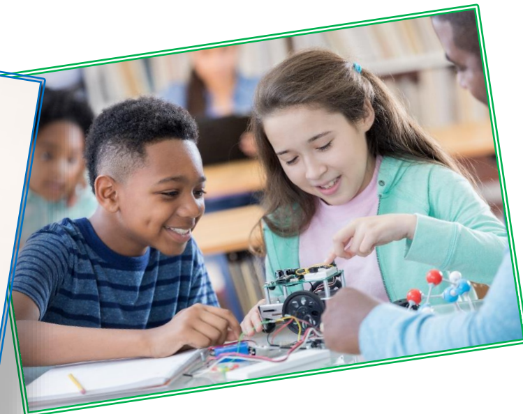
Image description: Two students working on a project.

Robotics – Gears and Gizmos- Design and build your own robots! Your child will explore the field of robotics through a series of exciting and dynamic lessons. Students will learn about mechanical engineering as they construct and use robots to complete tasks and engage in competitions. A variety of topics will be covered including gear ratios, electricity, rotation, friction, force, transmitters and LEDs. This course gives students the opportunity to experience the captivating world of robotics in an inviting and fun environment. No previous experience is necessary; both new and returning participants are welcome! Each participant will receive an award on the last day of the session and will have the opportunity to earn Energy Belts by demonstrating their learned skills.