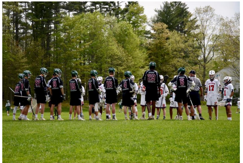
Varsity Lacrosse Last Year during Spring Eaglebrook Day

Eaglebrook and Cardigan have long had a friendly rivalry, and this is a tradition borne right out of it. Cardigan has two Eaglebrook Days each year, one in the fall and one in the spring. On these days, games go on all over campus. Almost all sport teams are guaranteed to have an Eaglebrook team to play against. This is a great opportunity to work hard and improve. It is also a great day to enjoy the show that both athletic programs put on. Of course, it is still a rivalry no matter how friendly it might be. GO COUGARS!!!