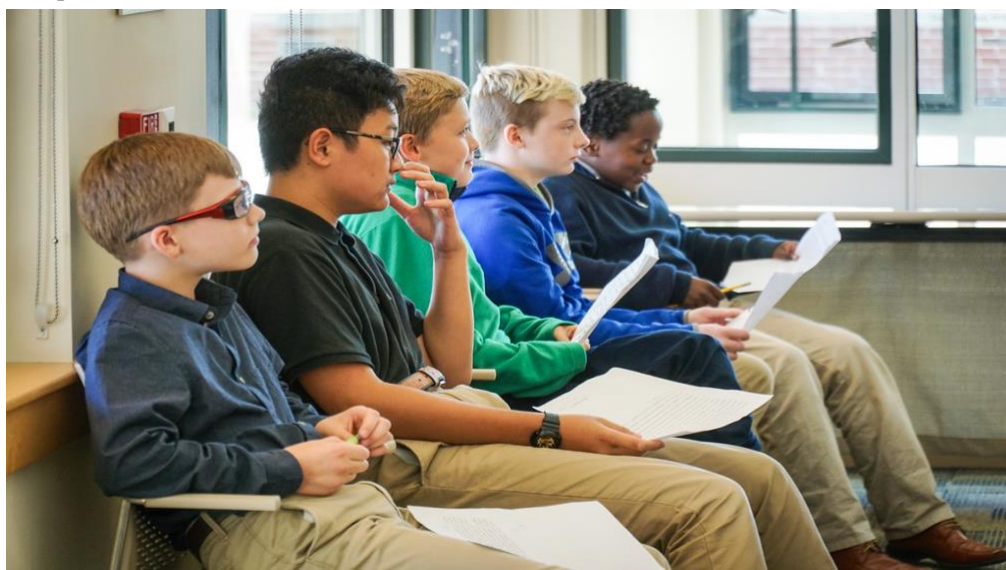
Candidates waiting to deliver their speeches