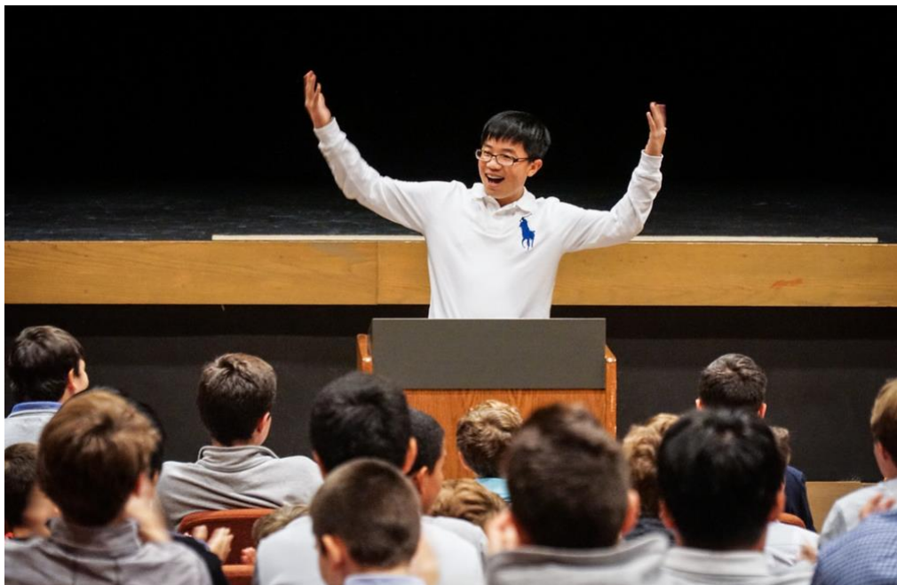
Student Senate Speeches

I’m hoping these ideas come from the students. I really want them to follow through on whatever they come up with and I’m really just there to help them with that. I’m hoping that the students that we elect have their own ideas from their classes of what they want to do. I know in the past that they wanted to have a dance, but it just never happened. Whatever it is that they want to do has to be seen through to completion.