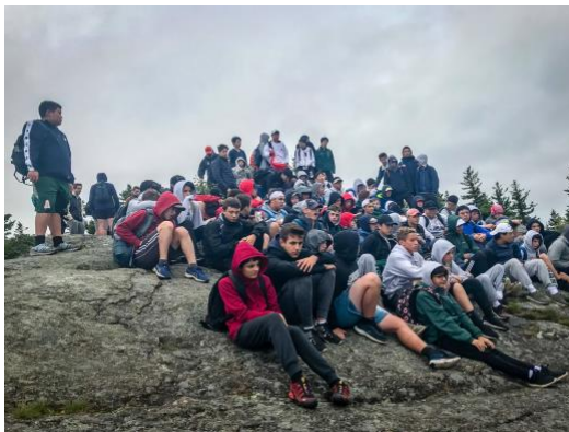
Ninth Grade Last year during mountain day.