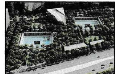
The 9-11 Memorial

Shopping Time in Midtown, Times Square, and Rockefeller Center!