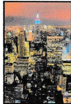
View from the Top of the Rock!

The 9/11 Memorial & Museum A monumental and moving tribute of remembrance and honor to the nearly 3,000 people killed in the terror attacks of September 11, 2001 at the World Trade Center site, near Shanksville, PA., and at the Pentagon, as well as the six people killed in the World Trade Center bombing in February 1993.