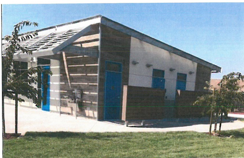
Paradise Valley – Gen7 Modulares

Committee members are appointed for a two-year term with no compensation for their participation. For the latest Committee meeting schedule, meeting minutes and other information, please go to http://mhusd.org/measure-g/ .