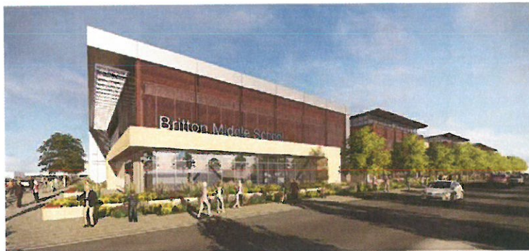
Future Britton Middle School – Library and Student Union Building