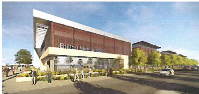
Future Britton Middle School – Library and Student Union Building