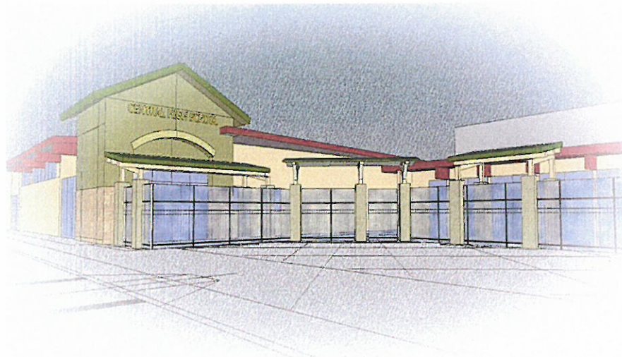
Loritta Bonfante Johnson Education Center – Phase II

Committee members are appointed for a two-year term with no compensation for their participation. For the latest Committee meeting schedule, meeting minutes and other information, please go to www.mhu.k12.ca.us/Measure-G/index.html .