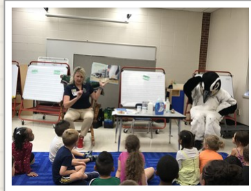
Sharing a Book About Penguins