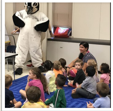
KC Zoo Visits SMECEC to Celebrate our New Mascot

Thank you for your partnership in your child's education and entrusting your children to our care each day. I am enjoying meeting and visiting with families each day either at drop off/pick up or in meetings to talk about your child's education.