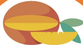
fruit (or vegetable)