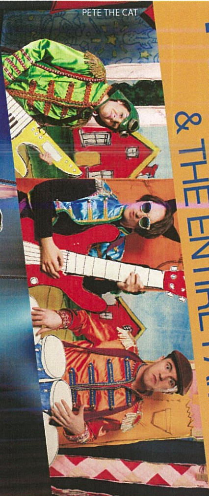
PETE THE CAT