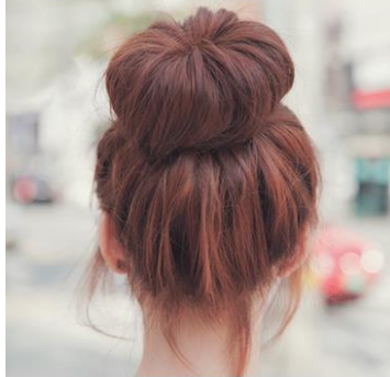
Bun too high, too big, and loose strands.