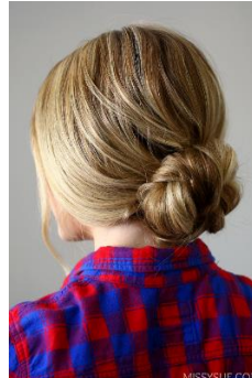
Too loose and loose strands.