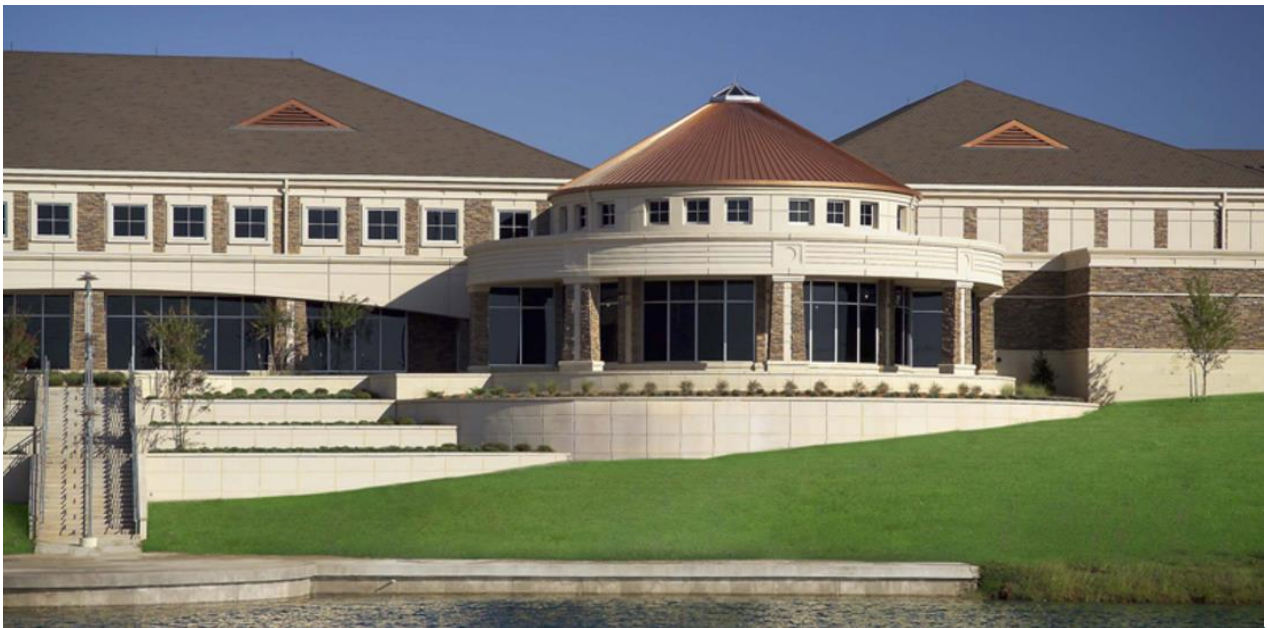
Moore Norman Technology Center 2019-20