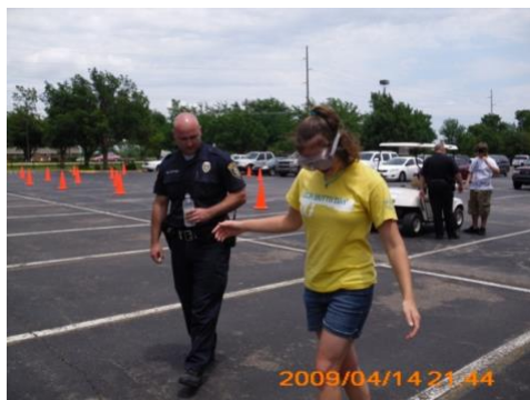
Figure 1 A student walks the line while wearing Fatal Vision Goggles, which simulates impaired vision.

The possession, use and sale of alcohol on the District's campus are governed by the Districts' drug and alcohol policies (found in the MNTC Student Handbook), the Drug-Free School/Workplace Policy (found in the MNTC Staff and Faculty Handbooks) and Oklahoma law. The enforcement of alcohol laws and policies on campus is the primary responsibility of Educational Services and Long Term Programs.