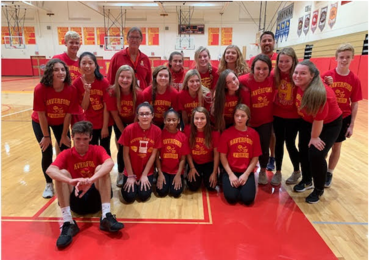
Students in Gym class wearing the RED OUT shirt for this evening Football game

Please remember as always: NO BOTTLES and or drinks of any kind NO BACKPACK NO BALLS, NO BIKES, and NO SKATEBOARDS Thanks for your cooperation!