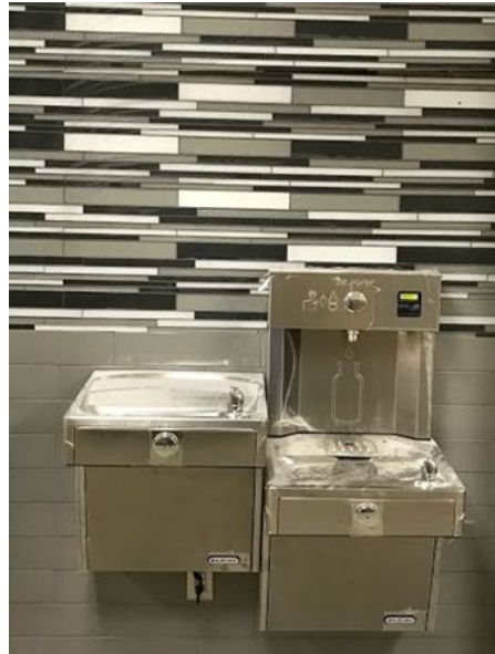
New water-bottle filling stations