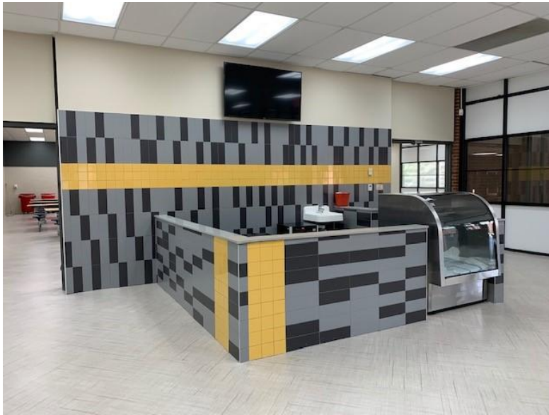
Renovated cafeteria with snack bar