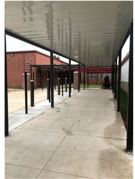
Walkway cover between East and West buildings