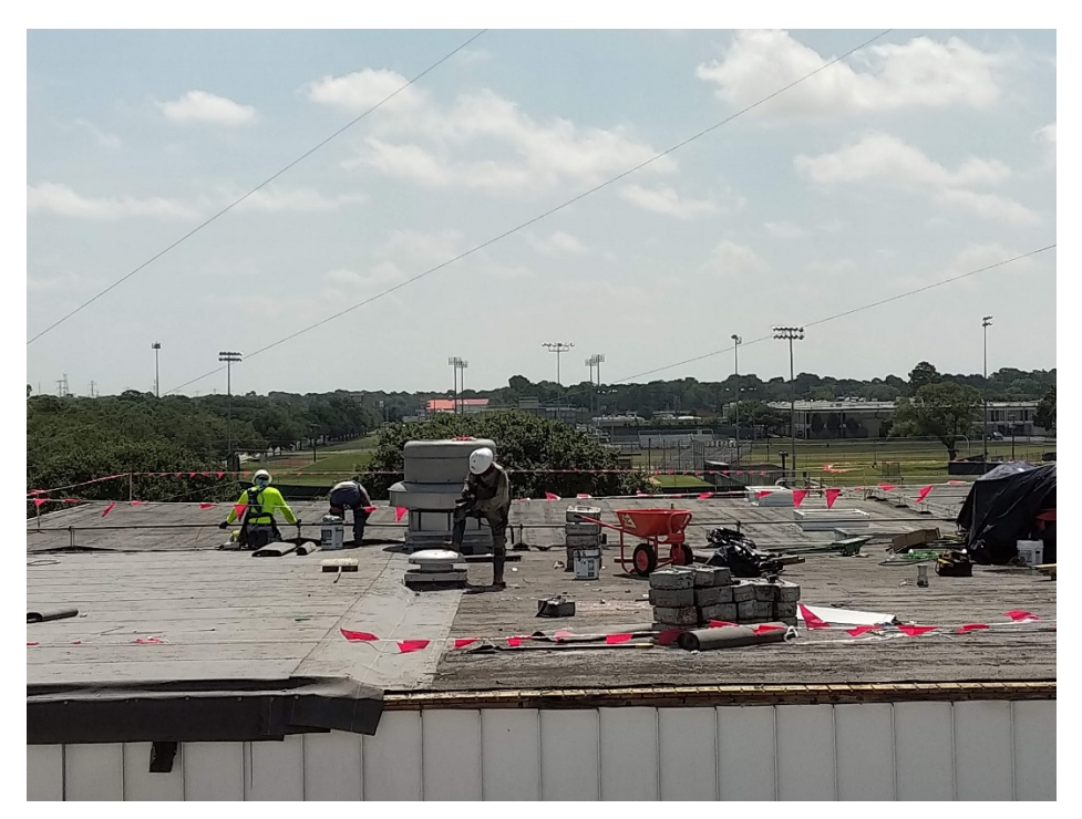
Installation of new roofing overlay continues.

3411 RICHMOND AVENUE, SUITE 725, HOUSTON, TEXAS 77046