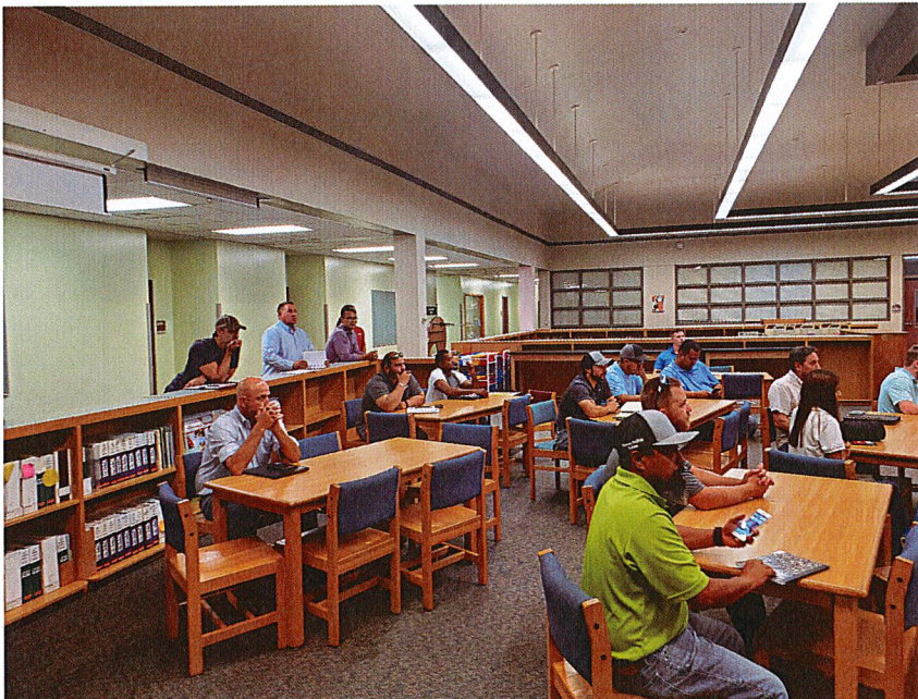
CM@R holds Pre-Bid Site Visit with Subcontractors 2017 SBISD Bond Facility Name: Cedar Brook Elementary