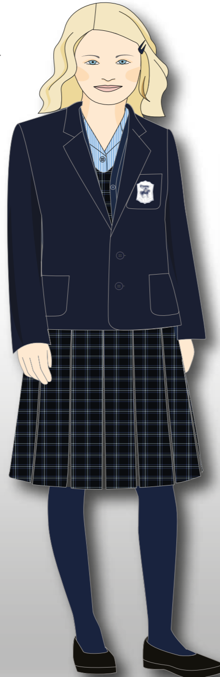
Reception - Year 2