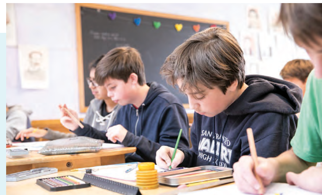
Eighth graders study subjects like revolutions, algebra, and creative writing