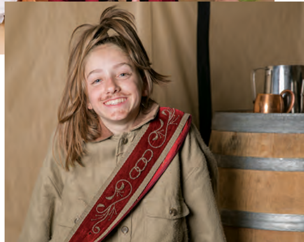
Much Ado About Nothing