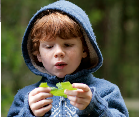
Gardening to Botany to Environmental Sciences

“ A kindergartener in the garden has a certain lightness of step, excited by all the activities ahead. He knows that mustard greens are spicy and that the purple cabbage is his favorite because it is crunchy. When a fifth grader sketches a plant, she discovers, through observation, that all flowers in the cruciferous family have four petals.