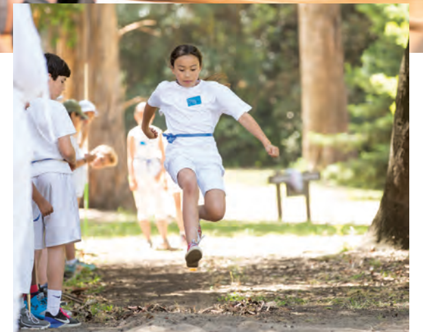
Study of Ancient India, Persia, Egypt, and Greece - here at the Pentathlon