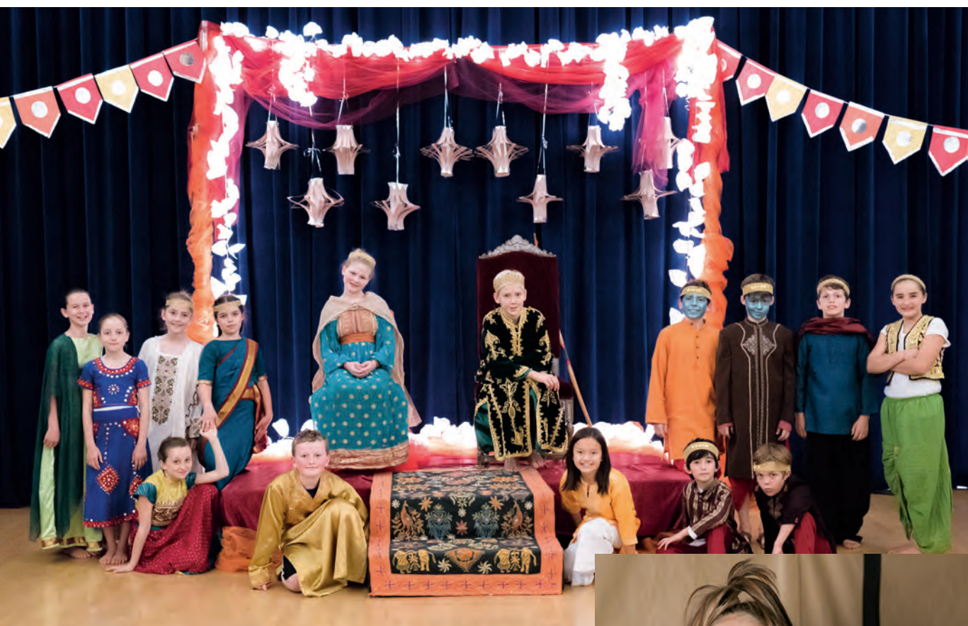
Presenting the Ramayana

“ Putting on a play requires intuitive and insightful vision about how you would like to project your character’s personality outwardly for your audience. It is tempting to hold back and only half-heartedly portray your character, but the emotions that are inside of us are what make the best actors so inspiring to watch. Each laugh or smile or even a nod can get your gears turning and unleash your inner actor or actress.”