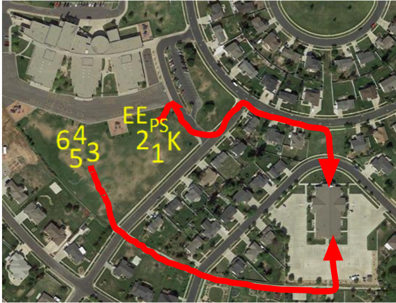
A. Travel route from the school building to 14 Bonanza Road