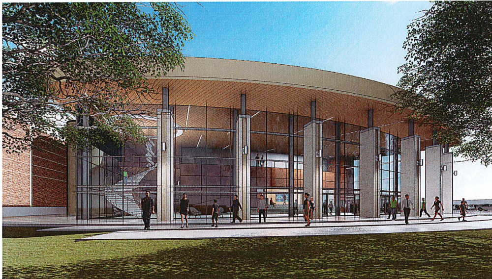
Schematic Design of Exterior