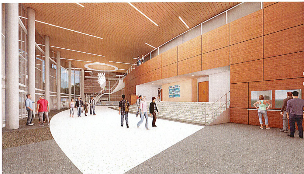
Schematic Design of Interior