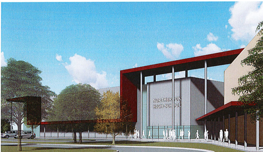
Schematic Design of Front Entry