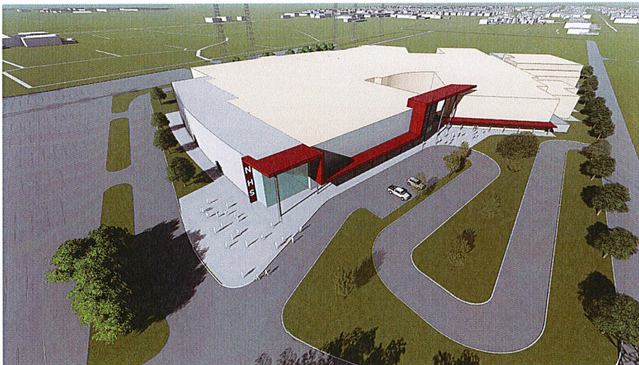
Aerial of Exterior Schematic Design