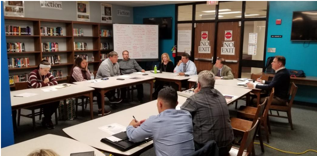
Fact Finding Meeting