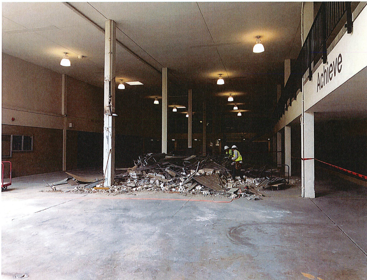
Demolition of the concessions stand