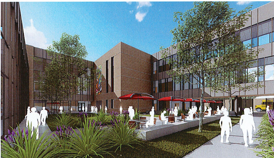
Rendering of "Learning Courtyard"