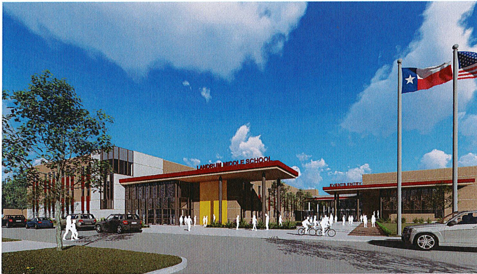
Current Exterior Rendering of Landrum MS