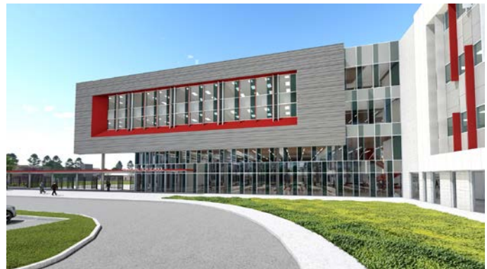
Design Development Renderings