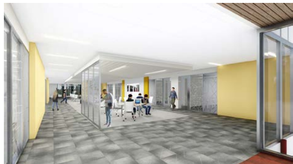
Interior Finishes Presentation