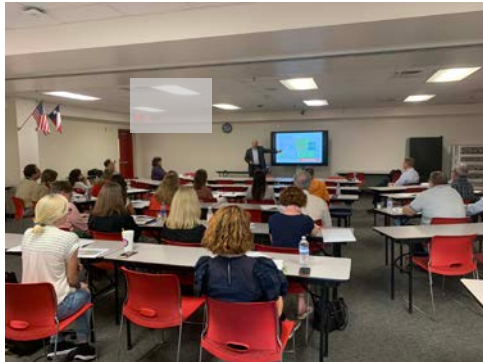
PAT #5 Meeting