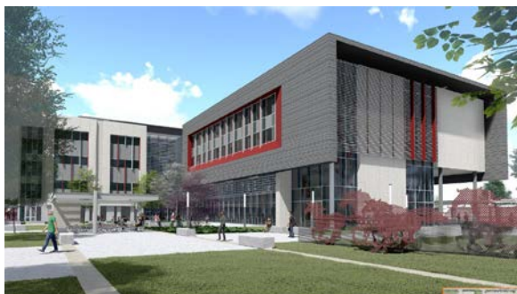
COURTYARD PERSPECTIVE (VIEW FROM LIBRARY)