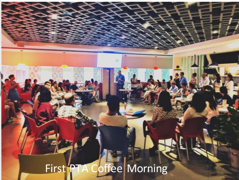
First PTA Coffee Morning