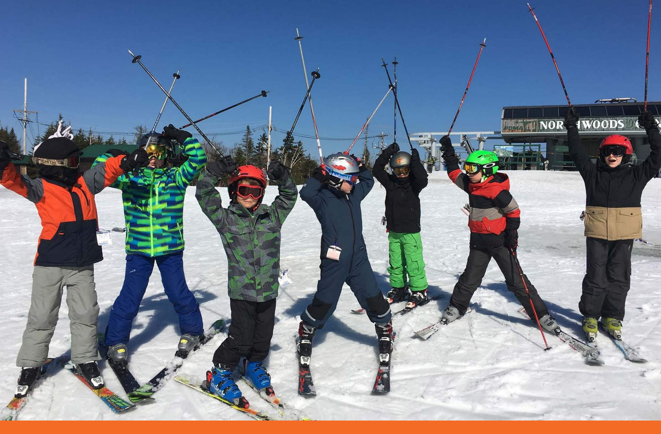
CAMPS & TRIPS