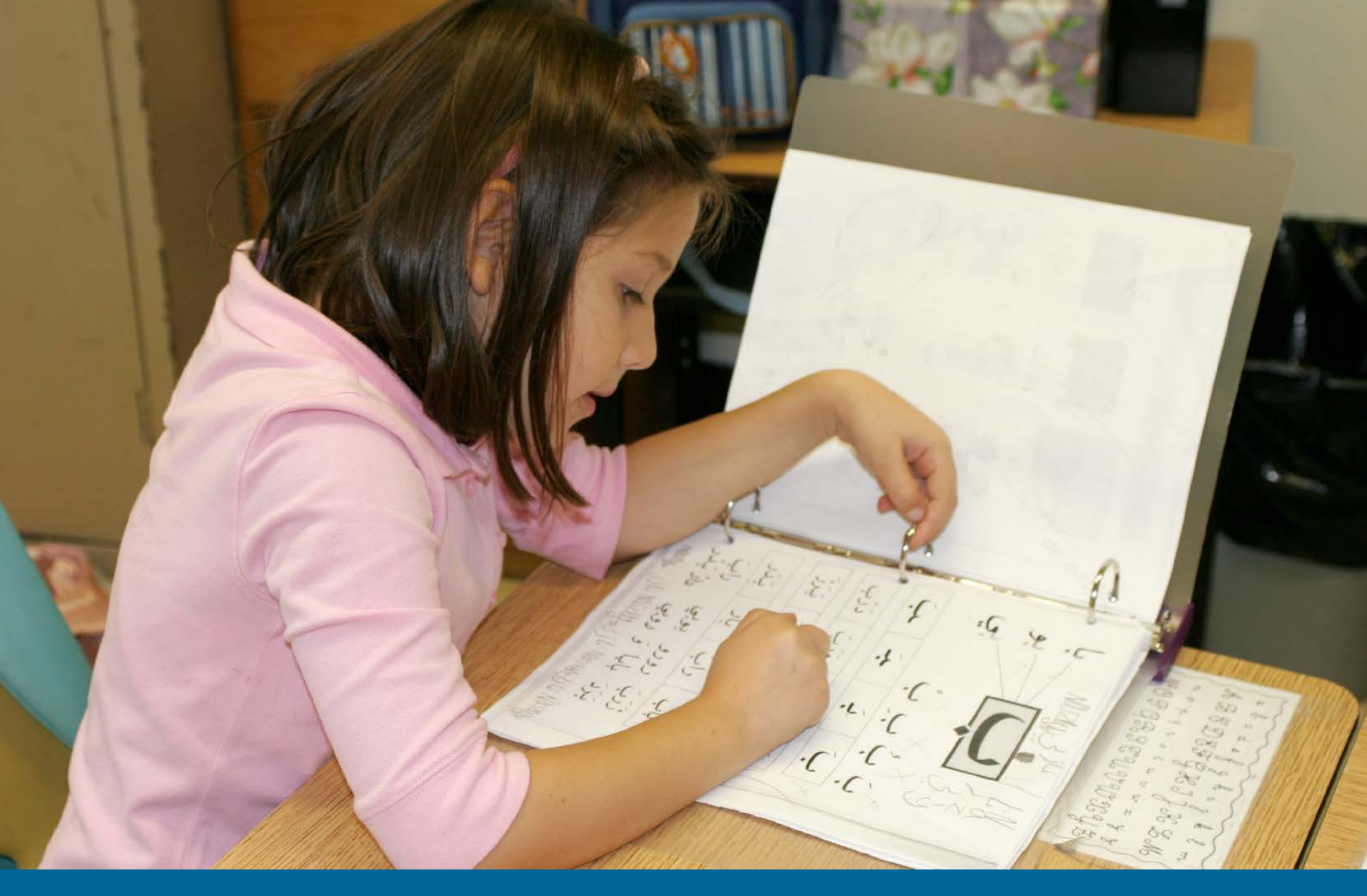
ADULT & LANGUAGE CLASSES