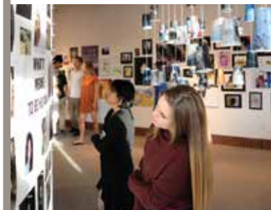
EXHIBIT RECEPTIONS TAKE PLACE @ 7 P.M.

THE GALLERY WILL CLOSE AT NOON ON EACH SHOW'S LAST DAY