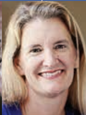
Dr. Jean Twenge