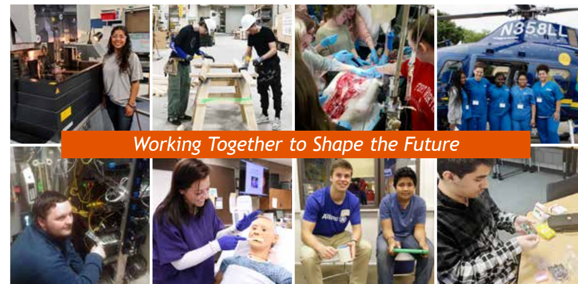
Working Together to Shape the Future

SERVING THE COMMUNITY by aligning educational opportunities with workforce needs. HELPING STUDENTS make informed decisions about their future career and college paths.