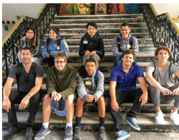
Student travelers at the Cascadas Nambilla, below left, and, at the Palacio de Carondelet, above.

Another highlight was "La Capilla del Hombre," or "The Chapel of Man," a museum dedicated to the works of Ecuadorian visual artist Oswaldo Guayasamin, a master painter and sculptor of Quechua and Mestizo heritage. Next up was a trip to "El Teleférico," a gondola that takes riders from Quito, at 9,000 feet above sea level, to 15,500 feet in a matter of minutes. The views from the top were stunning. The group was able to see