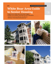
White Bear Area Guide to Senior Housing

Call 651-653-3121 to request printed copies of Senior Program resources: