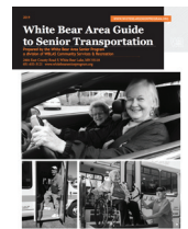
White Bear Area Guide to Senior Transportation