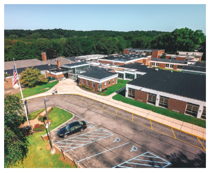
The Wampus School