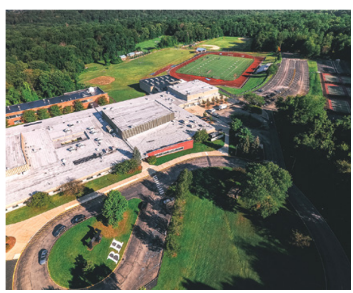
Byram Hills High School