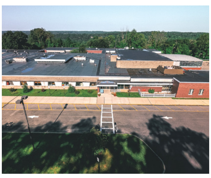
Coman Hill Elementary School

As new NYS testing requirements are announced, some calendar adjustments may be necessary.